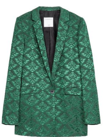
Photo Courtesy of Instagram, please note Sandro does not own the rights to this image.